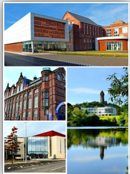
A snapshot of visited archives. From top to bottom: Gwent Archives, Tyne & Wear Archives, Stirling University & The Public Record Office of Northern Ireland

Some locations have provided very little in the way of relevant documents but the process goes some way to show the efforts the Inquiry is making in its determination to establish the facts. We continue to liaise with repositories not yet visited and the search will resume again once the current restrictions are lifted. In the meantime, we are analysing the huge amount of material we have already gathered.